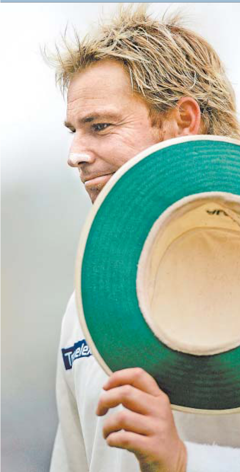
Shane Warne at the Oval yesterday. Sport »