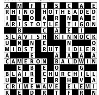
Solution No. 26,046