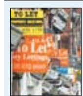
Birmingham has become the city of choice for many of those leaving London and hoping to get a foot on the property ladder.

year of the credit crisis figures are likely to be of the true numbers of people in their thirties migrating from London.