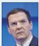
George Osborne gives autumn statement on Wednesday – and more of the same is not an option, say council leaders.

The letter states: "Earlier this week, the Smith commission [on Scottish devolution] set out a better deal for Scotland, granting more control over funding and recognising the importance of devolving power down beyond Holyrood. It's England's turn now."