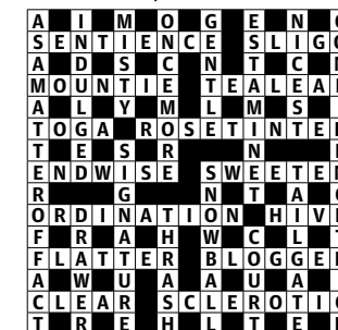
Solution No. 26,237

The first 10 correct entries drawn win Guardian Style and Secrets of the Setters, worth £28.99.