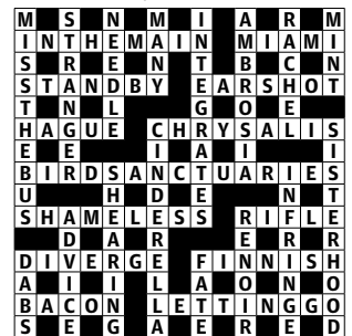
Solution No. 26,221