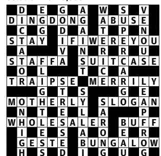
Solution No. 25,936