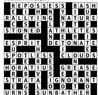
Solution No. 25,377