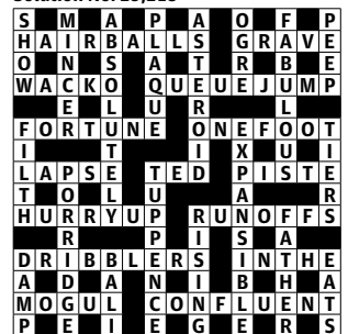
Solution No. 25,218