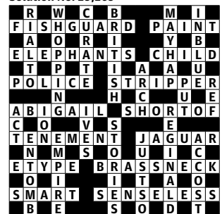
Solution No. 25,205